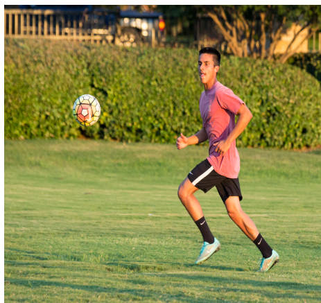
Students participated in intramural soccer earlier in the week.