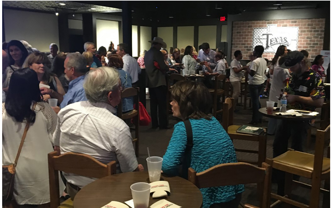
Supporters of Smoke-Free Fort Worth hung out and listened to live music while they waited for the event's speakers at Billy Bob's Texas.