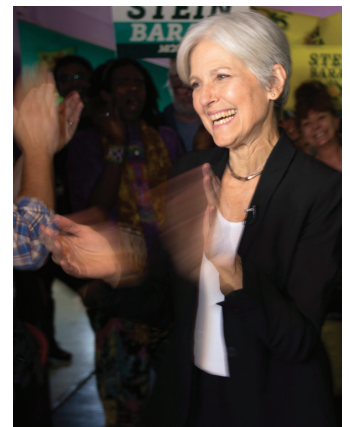
Voters have considered voting for Gary Johnson, Evan McMullin and Jill Stein.