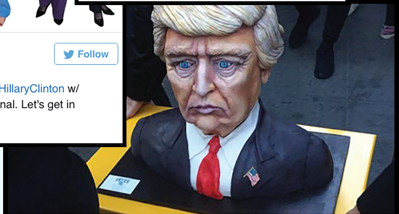
josh groban ✓ @joshgroban

The expression on this trump cake being wheeled into trump tower is everything I needed tonight. Yes. Good.