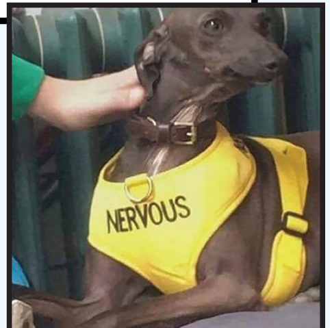
#VOTEHILLARY ✓ @tyleroakley