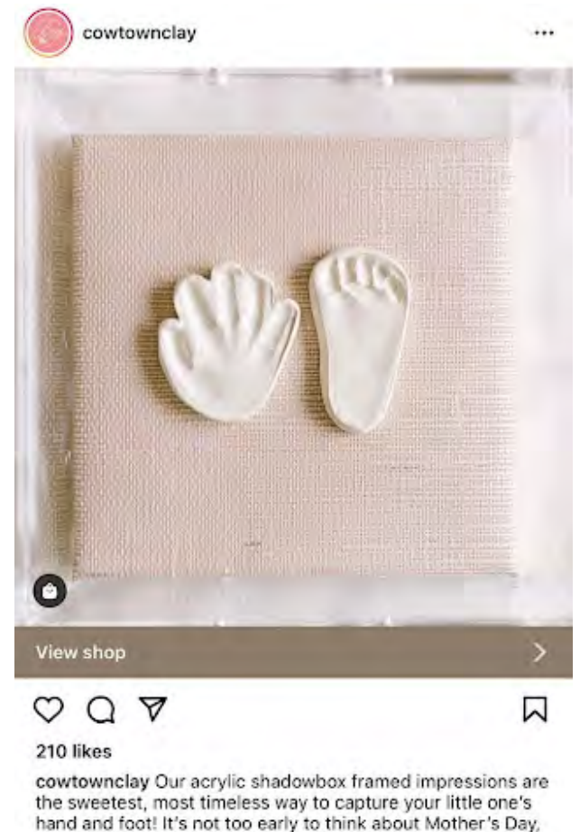
An example of Cowtown Clay's products.

These owners are some of the many women in Fort Worth that followed their-business dreams. The female-owned business community will only grow stronger as these women inspire more individuals to do the same.